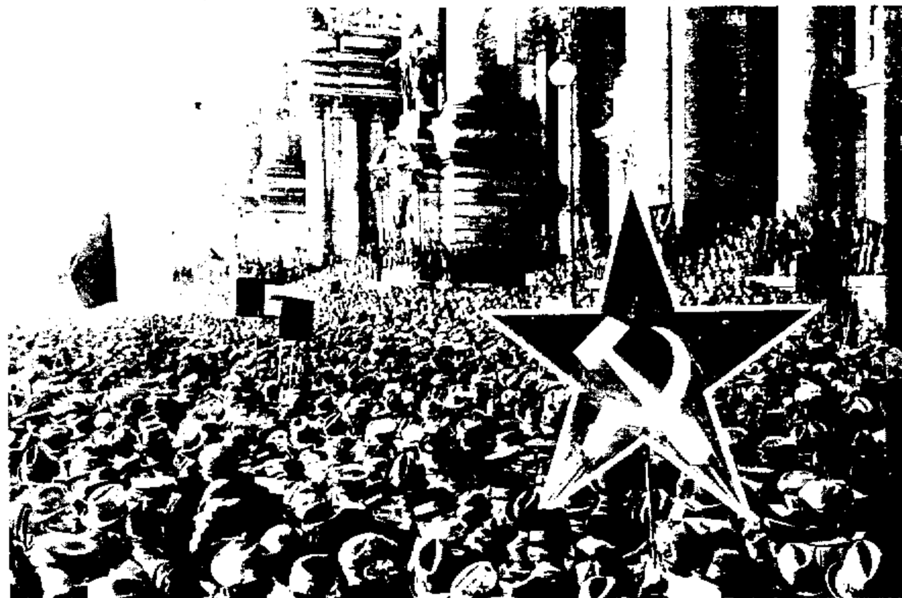
Berlin Nov. 1918. Workers, already influenced by the Russian Revolution, end the war.

On the 16th November, the Freie Gewerkschaften (Free - i.e., Social