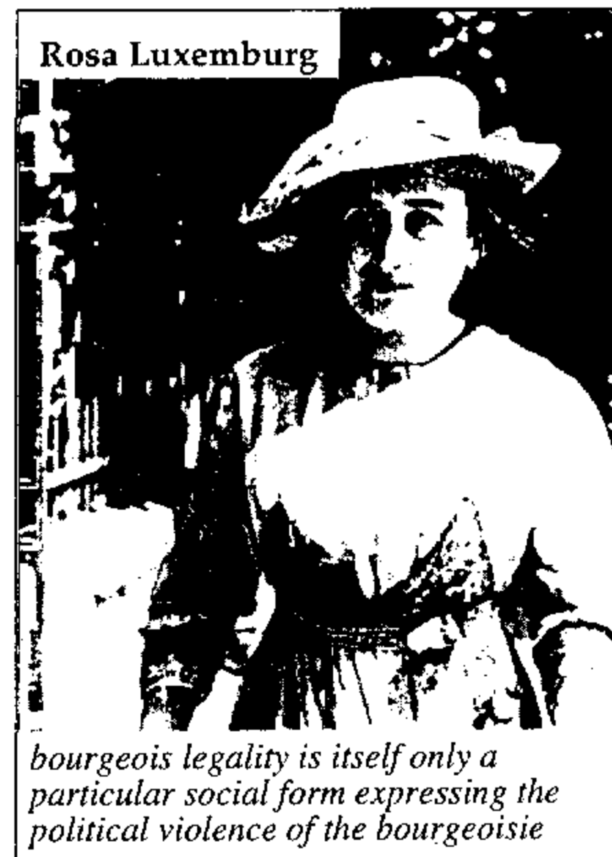
bourgeois legality is itself only a particular social form expressing the political violence of the bourgeoisie

In 1882 Bebel had already rejected these