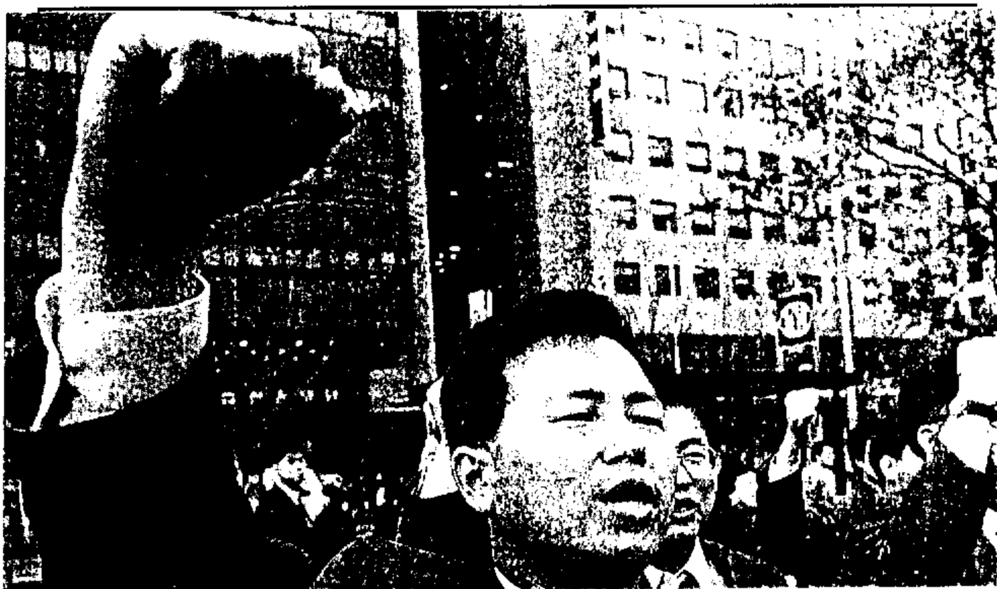
Clenched fists but these Korean stock market workers were only demonstrating to shut the markets!

(The present amount of global debt, corporate and personal combined, is $33,100bn, or 130 times more than the value of annual global product.) The colossal sums of capital being invested in the financial rather than the productive sphere is testimony to the dearth of profitable outlets where new surplus value can be generated. The worldwide increase in absolute exploitation of the working class, while unemployment remains and in the face of 'labour saving' new technology, is testimony to capital's desperation to raise profit rates.