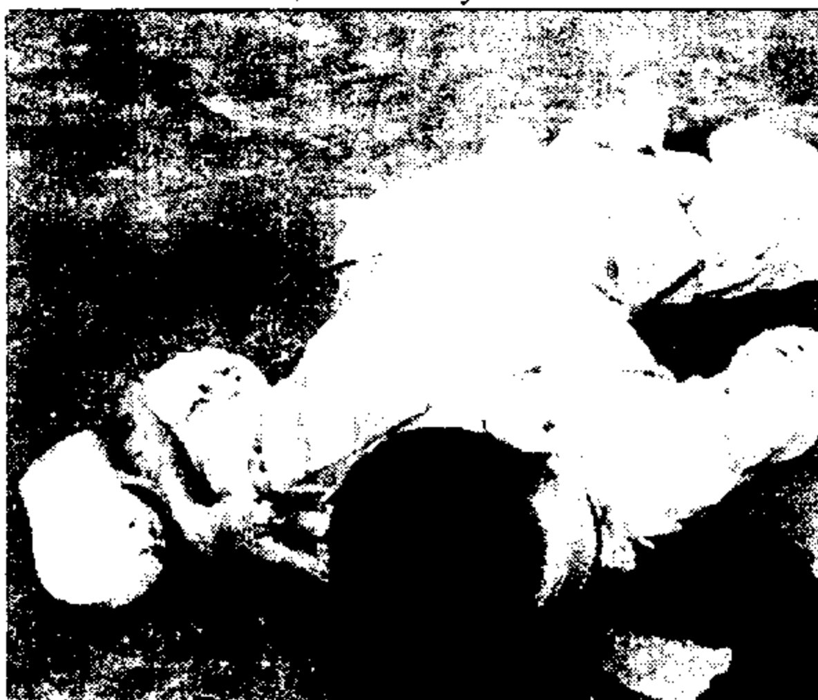
A victim of the pro-Indonesian militias. Just one of 300,000 victims of imperialism in East Timor

colonies at the end of the second world war, the Portuguese managed to re-establish their control of East Timor. This control lasted until the collapse of the Portuguese dictatorship in 1974. At this stage the African colonies of Portugal all appeared likely to become Russian clients because of Russian support for the liberation movements. The US, of course, had supported Portugal's wars to retain its colonies through NATO. The US feared that East Timor might also become a Russian client if it became independent. In 1975 the US had just been defeated in Vietnam and was facing an increased Russian naval challenge in both the Indian and Pacific oceans. Although East Timor does apparently have undeveloped oil and gas deposits, it is an economically unimportant region, producing mainly coffee and sandalwood and was of no economic interest to the US. However, the country was in a stra-