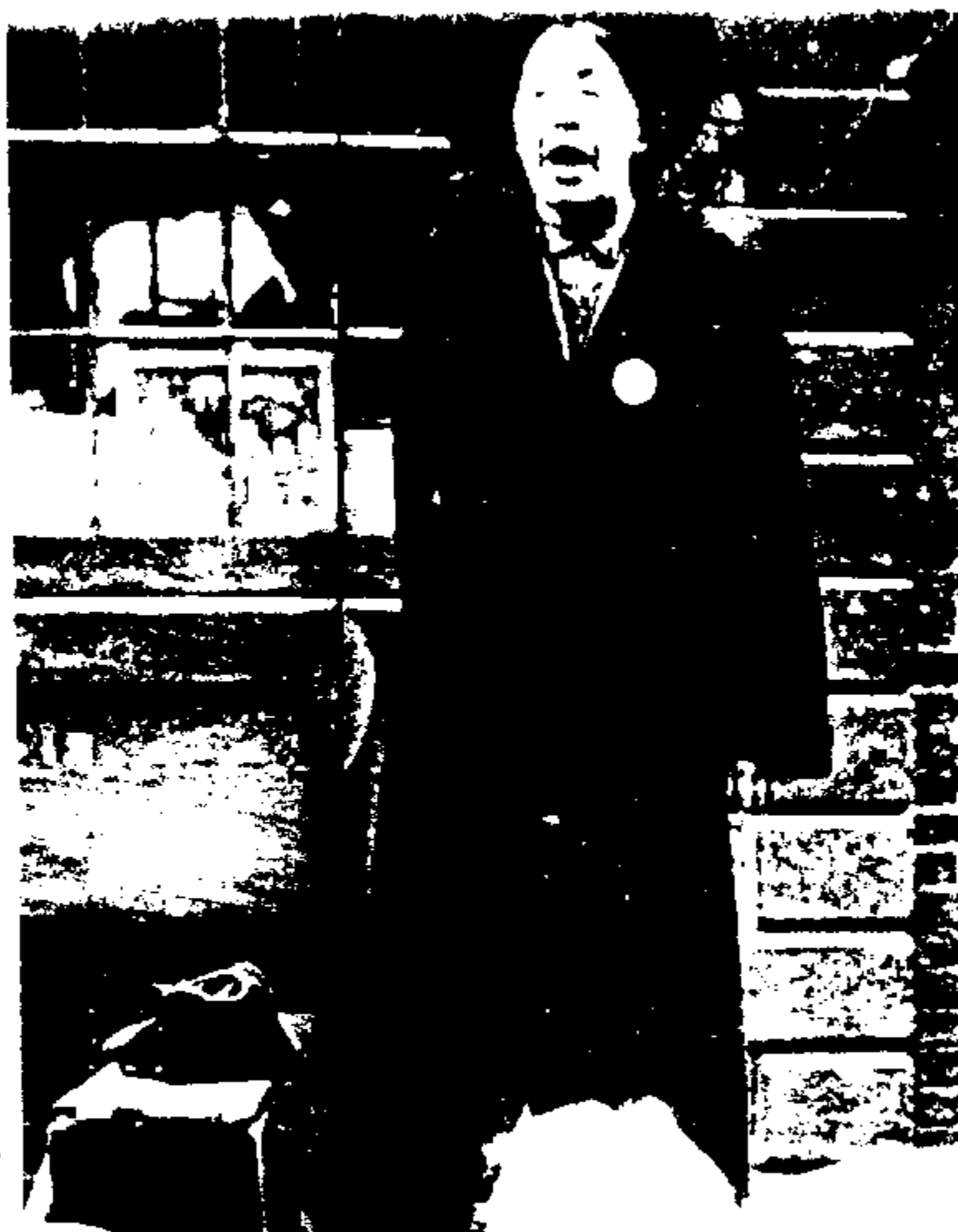
Sylvia Pankhurst speaking in Manchester bodies.

In spite of the NEP and the advocates of State capitalisation and trustification, however, the urge towards free and complete Communism is not dead in Russia as is evidenced by the existence of the Workers' Group and other Left Wing