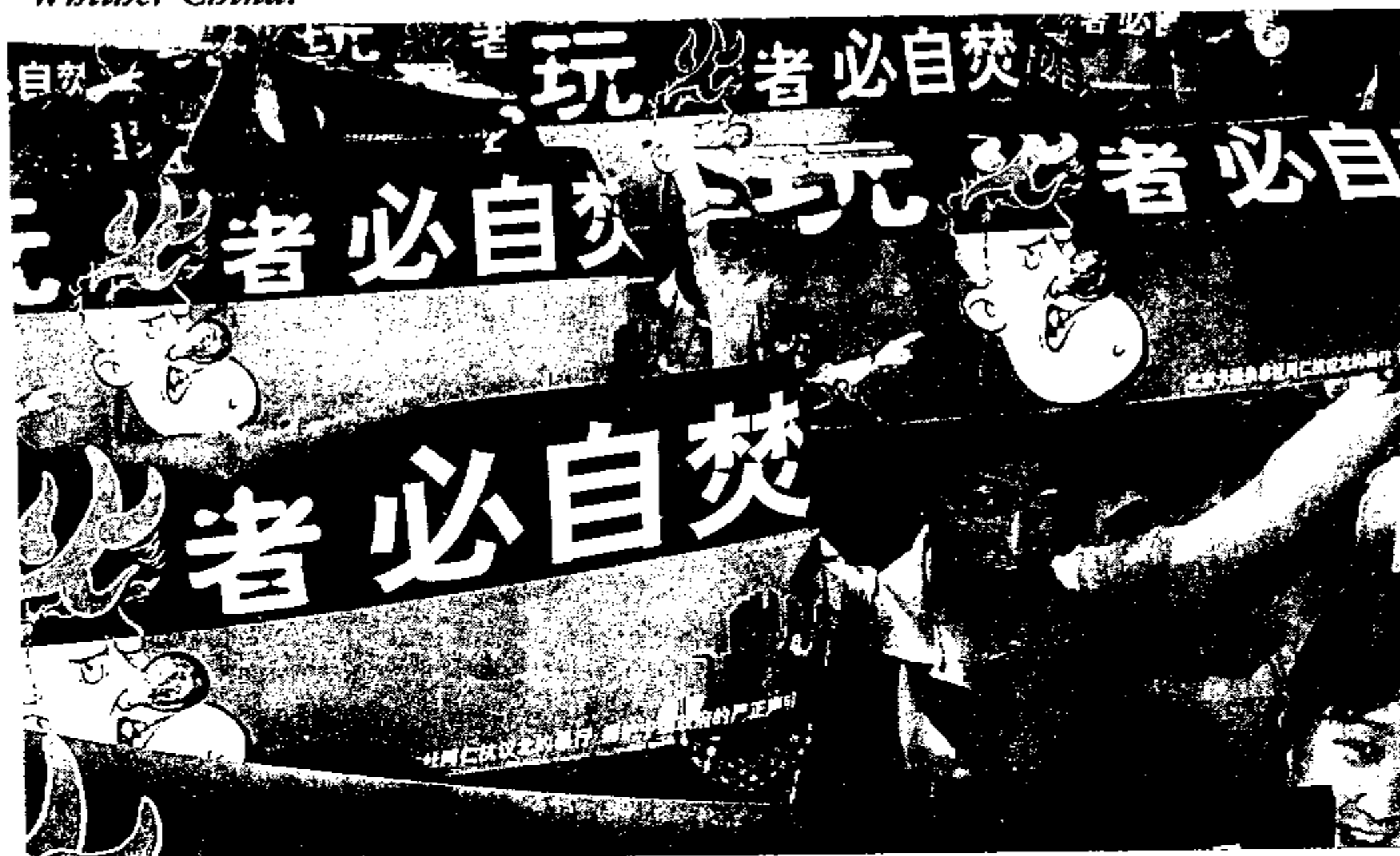
Demonstration in Beijing against the US bombing of the Chinese Embassy in Belgrade

Poverty is on the increase in China as the contrast between classes and regions increases. UNICEF and the World Bank have arrived at a figure of 300 million in desperate circumstances. The decline in the state budget, allowing provinces to gather more taxes, has created a crisis in health care and education. Rural areas are most affected. Schools in rural areas and poor province's budgets are big enough for the wages of the teachers employed and the upkeep of the buildings, but they have nothing for textbooks and other materials. Rural health care workers often do not get paid and in towns generally are paid only 66% of their proper salaries. Parts of China have an infant mortality comparable to Sub-Saharan Africa.