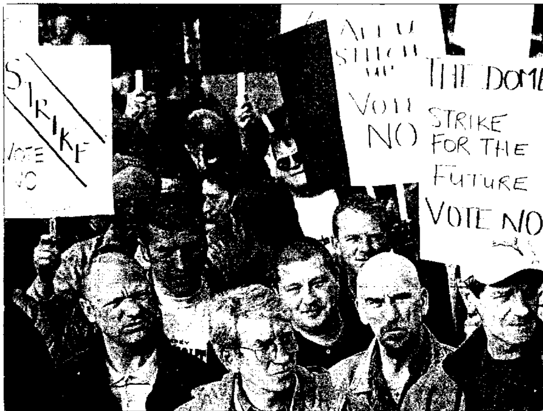
Sparks in London taking on the bosses, the unions and the law