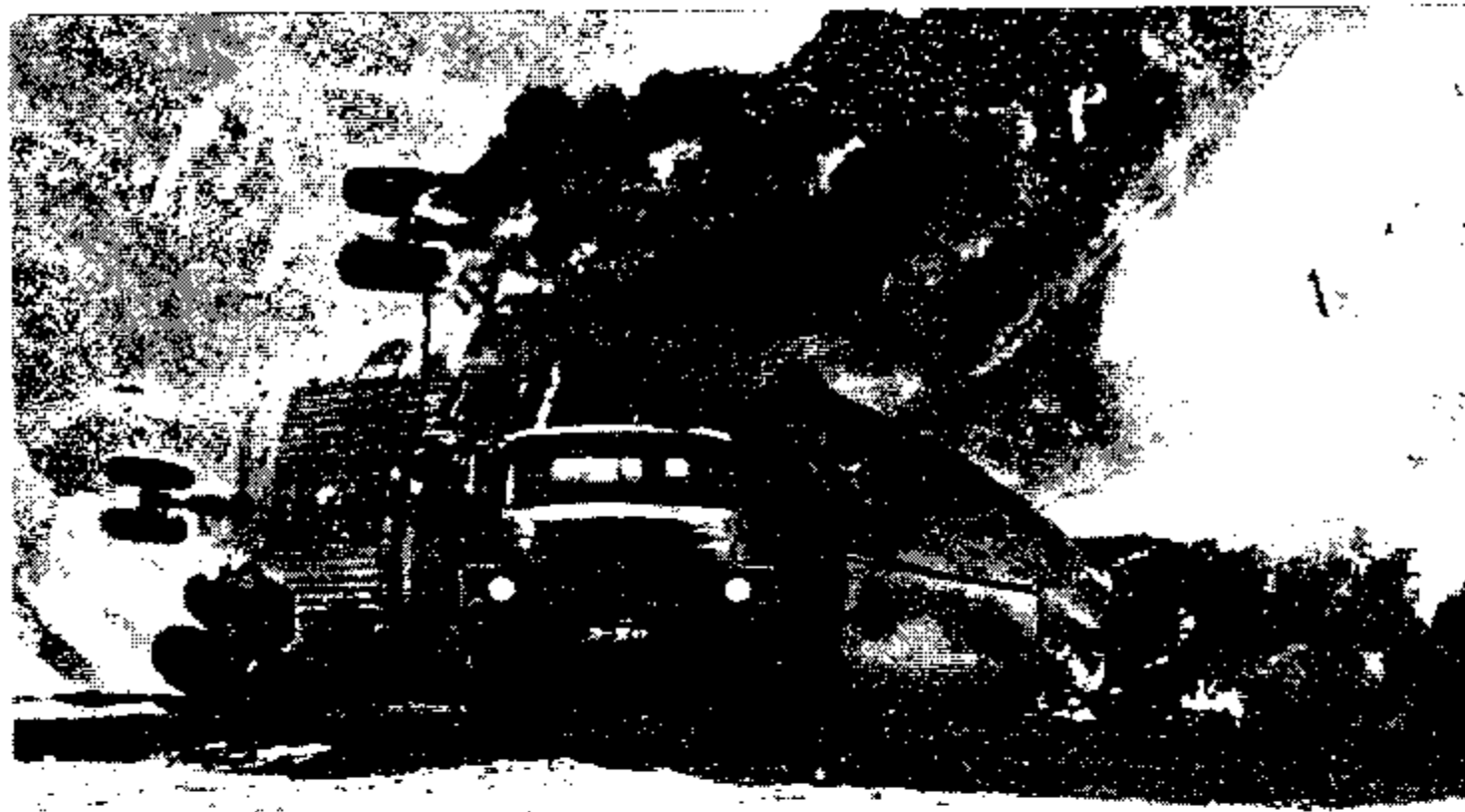
The fire last time. A Russian transport plane burns in Chechnia

support of the USA. However the NATO victory in Kosovo has created a backlash against the USA and its allies this summer. As the war in Kosovo began the USA looked to be well on the way to breaking Russian control on its own Caspian and Caucasian borders. The CIS (the Commonwealth of Independent States set up as a successor to the old Soviet Empire) had been reduced to Russia and Kazakhstan. At the same time the CIA had managed to get Georgia, Ukraine, Uzbekistan, Azerbaijan and Moldova into an anti-Rus-